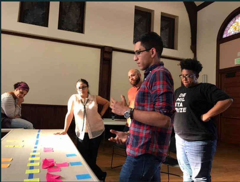
DRUUMM Steering Committee meets at the First Unitarian Church of Oakland October 2016